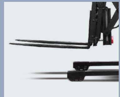
Proportional controlled forks can be operated more accurately