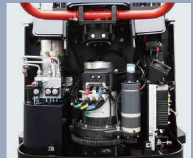
Back cover can be opened fully