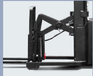
Forks move forward by the scissor structure