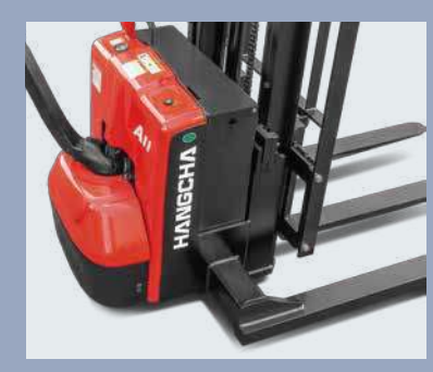
The compact body and big rounded design provide an ideal operation in limited space, and the wedge designed chassis greatly increases the passing ability