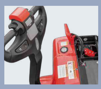
Built-in charger and maintenance free batter