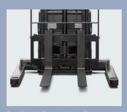
Fixed Straddle Baselegs (Inside Dimension in 4" increments from 38" to 50"); Adjustable baseleg optional to fit a wide range of pallet sizes