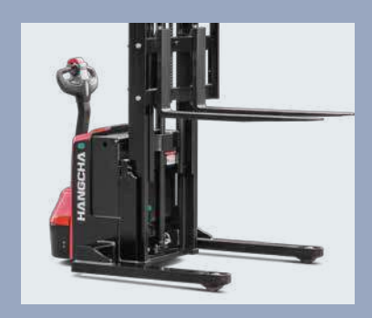
Pump motor controller offers proportional lowering, it can provide low noise, precise control and stable lower good