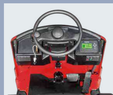
Modern outline design with LCD instrument and USB charging port