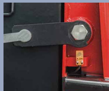
The locking device of the battery is provided with the safety protection function. Only if the locking device is rotated in place, the tractor can travel