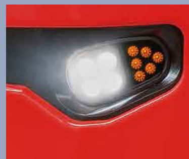
Reliable LED lighting