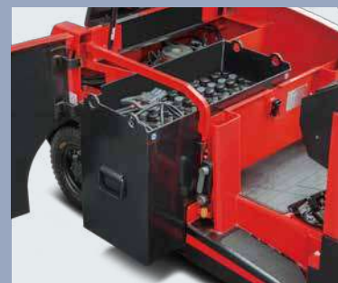
Battery side roll out is taken as the standard configuration in order to easily and fast replace the battery