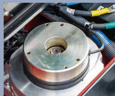
Electrical Park Brake (EPB) system