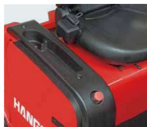
Cup holder, tool box