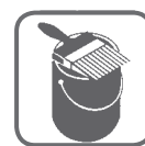
Special Paint Colors