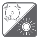
Visual or Audible Signals