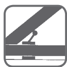
Electrical Limit Switch

Lifts in our Modified category can be equipped with any platform size up to 72" x 96" in 1" increments plus many of our most popular options* and ship in two weeks or less.**