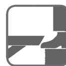
Bevel Toe Guard