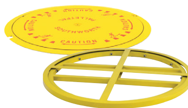
PalletPal Disc Turntable PalletPal Ring Turntable