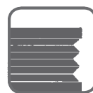
Bellows Accordion Skirting