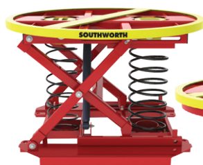
PalletPal 360 Spring PalletPal 360 Air