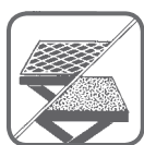
Anti-Skid Platform Surfaces

Lifts in our Modified+ category include all models from our Stock and Modified categories plus a wider range of options including those shown below and many more.* In many cases we can even do light customization and still meet the three week shipping window.**