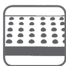
Ball Transfer Top