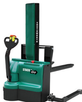
Stack-N-Go All Models