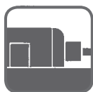
Larger Power Units