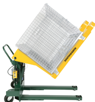
Portable Tilter PTU2