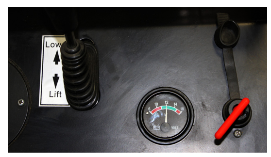
Easy access controls