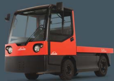
Model W 20

Powerful tow tractor with low profile chassis and fully equipped hydraulically damped driver's cab with sliding or hinged doors. Available in short or long wheelbase versions with twin maintenance-free AC drive motors, all-wheel suspension and braking, travel speeds up to 25 km/h, hydrostatic power steering and inching control.