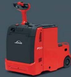
Model P 50

The unique design of the operator's compartment offers a level of comfort previously unknown in the market using a unique suspended and damped 'U' shaped platform. This provides a superior driving experience over long travel distances or on uneven floors. Particularly suited to towing applications in narrow aisles the compact design allows the operator direct access to the towing coupling. The P 30 C has a travel speed of up to 10 km/h and the P 50 C up to 8 km/h, both laden and unladen.