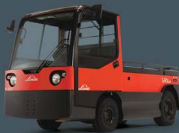
Model P 250

Modern styling, compact design and low centre of gravity provide excellent stability and manoeuvrability. High efficiency microprocessor-based digital controller permits precise control of speed and acceleration. Tilting seat cover allows easy access to battery (24 or 48 volt). Optional driver's cab or canopy are also available.