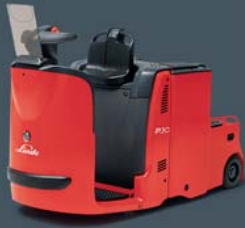
Model P 30