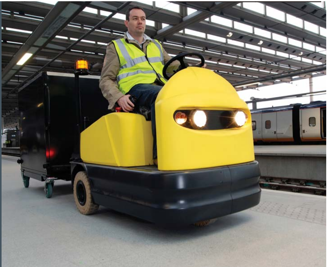
Linde P 60 Z in Eurostar livery at St Pancras.