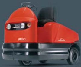
Model P 60 Z