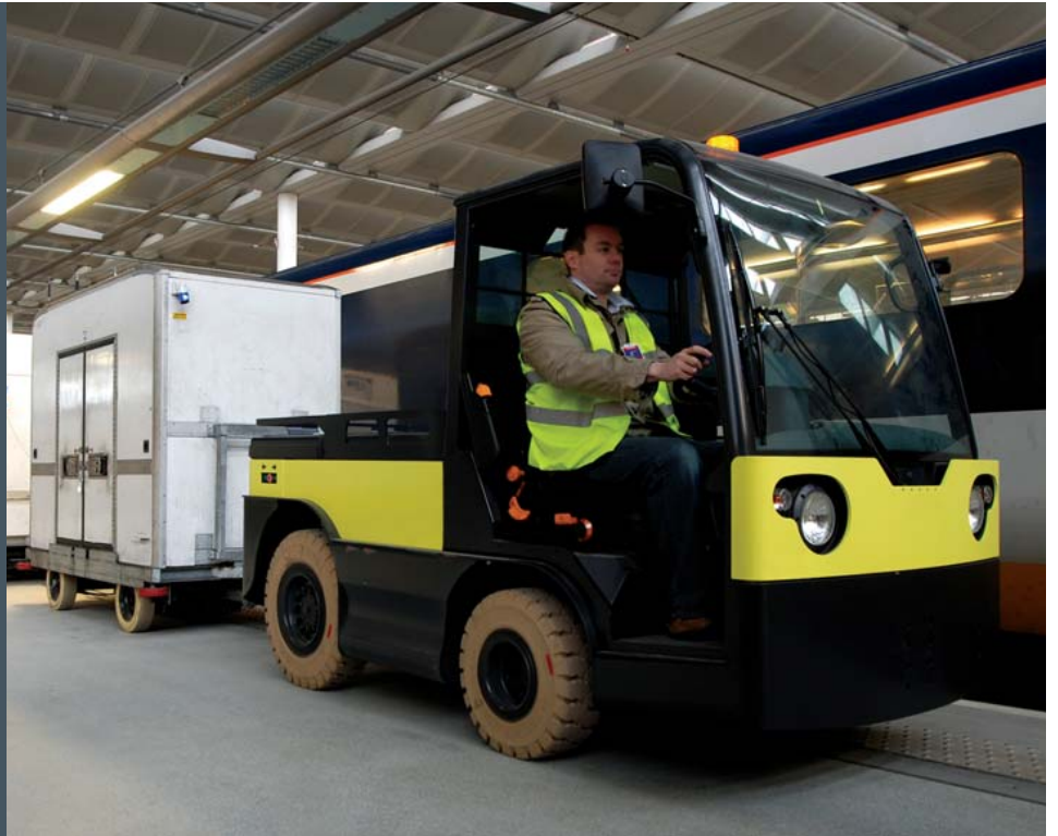
Linde P 250 in Eurostar livery in operation at St Pancras International, London.