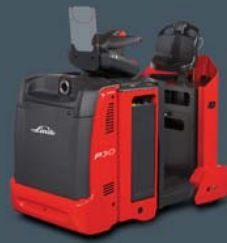
Model P 30 C, P 50 C

This compact stand-on tow tractor is designed to undertake versatile and highly efficient load transfer duties in a wide variety of applications where space is at a premium. Twin-grip self-centring steering requires minimum effort and contributes to maximum manoeuvrability. The powerful AC drive motor gives seamless acceleration to 10 km/h, laden or unladen.